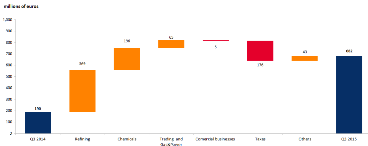
Downstream Adjusted Net Income/ (Loss) variation Q3 2015 vs. Q3 2014

This marked increase in income is mainly due to: