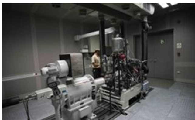
Engine test bed image