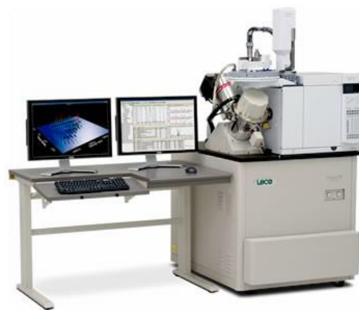
Two dimensional gas chromatographer hyphenated to Mass Spectrometer Time of Flight (GCxGC-TOFMS)